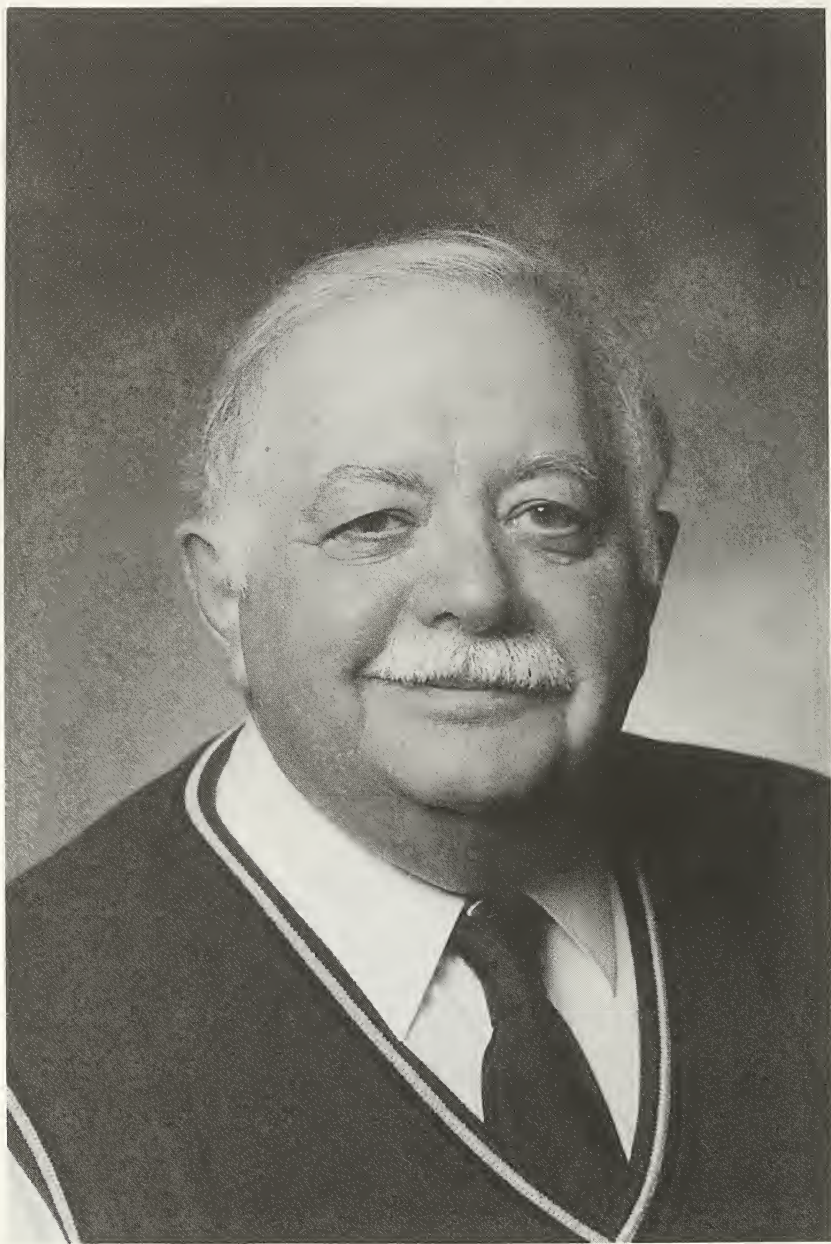
Oleg Grabar, ca. 1995